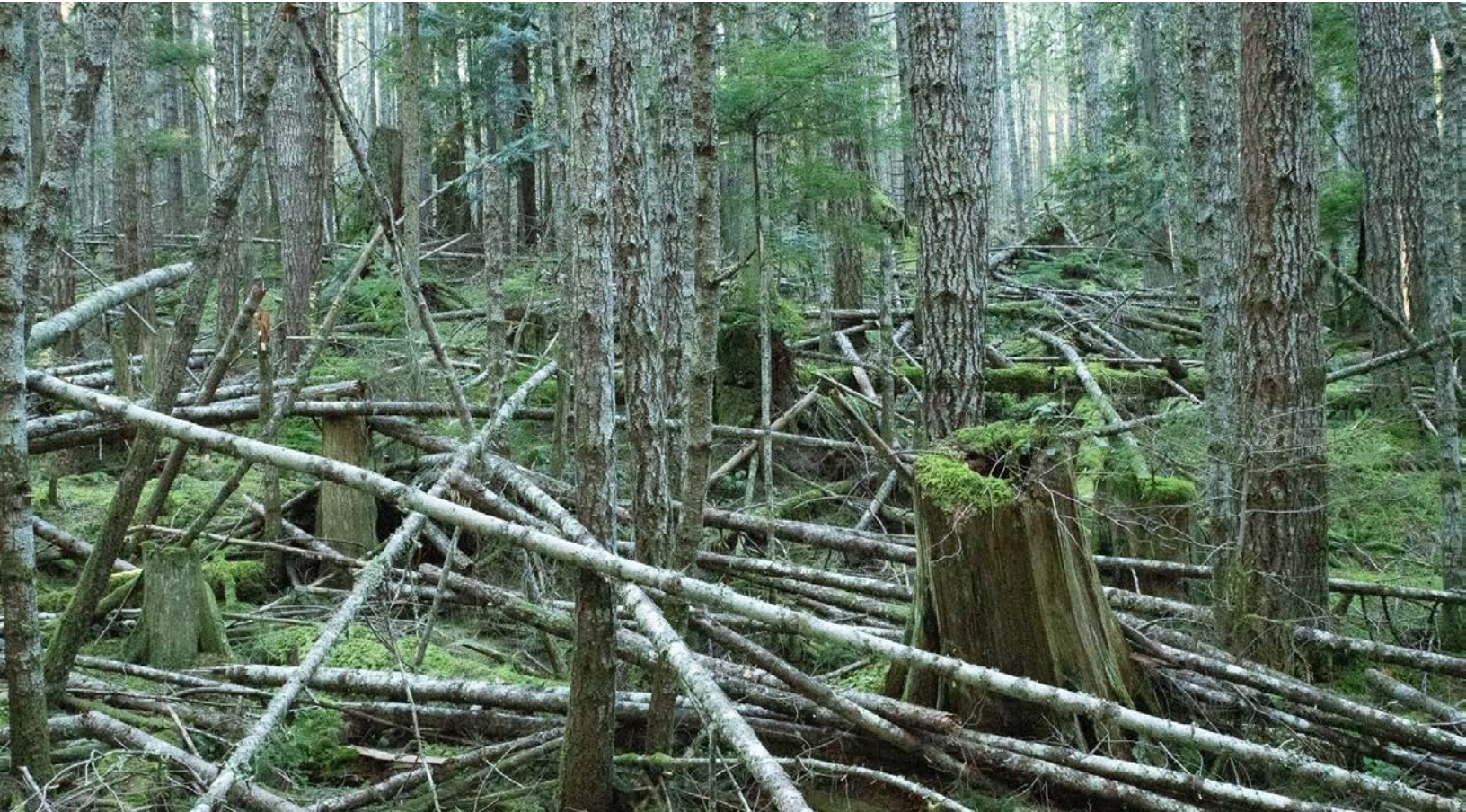
Photo 4: Common structure and condition of forests found throughout the CDF.