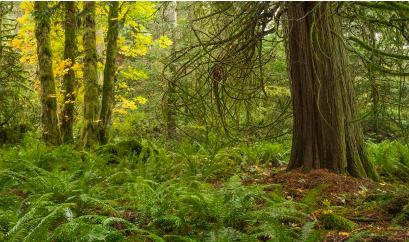
Photo 2: Establishing characteristics typical of older growth forests is one of the goals of this work.